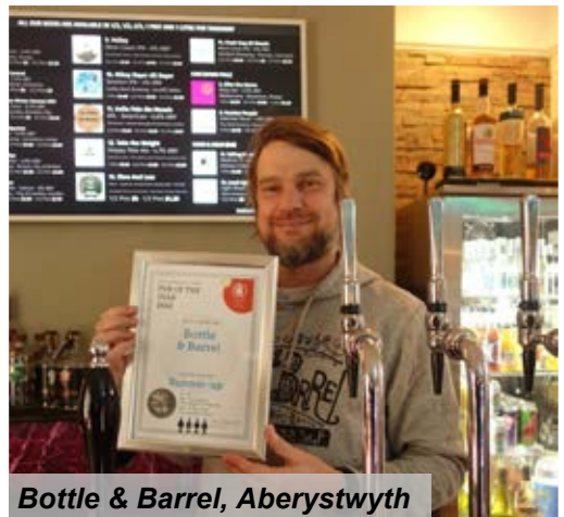
Bottle & Barrel, Aberystwyth