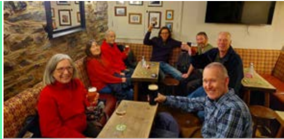
Local CAMRA members in the Ship and Castle

Front cover: Vale of Aeron, Ystrad Aeron