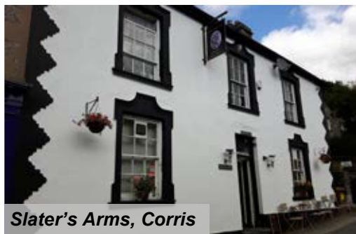
Slater's Arms, Corris

Corris – Slater's Arms: Grade II listed freehouse. Bar with slate flooring and inglenook fireplace. Accommodation. Good value evening meals and Sunday lunch. Occasional live music. Three ever-changing real ales (try them all on a third pint platter). Two Welsh real ciders. Bae Ceredigion CAMRA Cider Pub of the Year 2022.