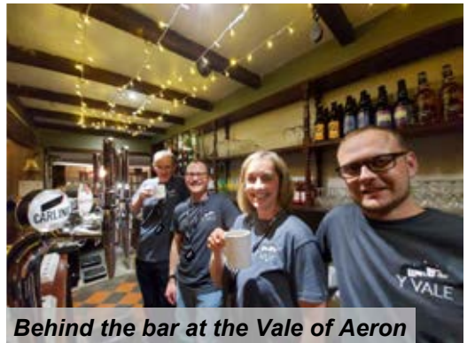
Behind the bar at the Vale of Aeron

The pub opened for three nights a week at first, offering one real ale from a Welsh brewery. Check current opening hours and the latest news on Facebook or www.tafarn.cymru .