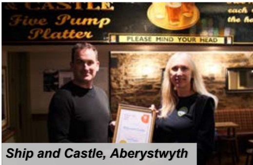
Ship and Castle, Aberystwyth

Local CAMRA members voted for their favourite pubs and then judges visited the top three shortlisted pubs anonymously to evaluate each one against CAMRA's pub of the year criteria. The quality of the real ale is the most important single factor, but judges also considered how well beer is promoted, the role a pub plays in its local community, the atmosphere, décor and welcome.