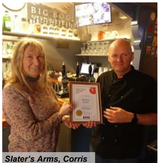
Slater's Arms, Corris

The runner-up was Kane's Bar in Aberystwyth which specialises in cider and sells a wide range from producers across the UK.