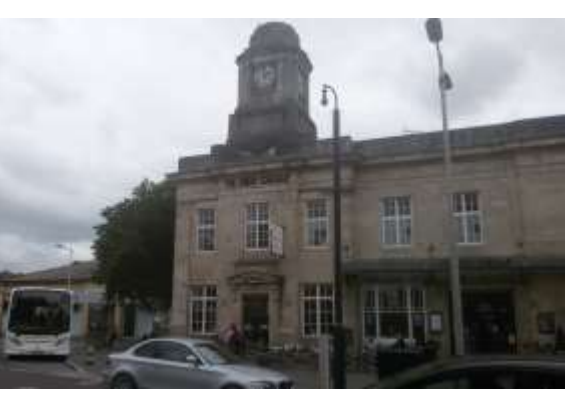
Yr Hen Orsaf

Our trip started at Yr Hen Orsaf , a Wetherspoons pub located in the old railway station building in Aberystwyth town centre. On the bar were the usual Abbot Ale, Ruddles Best and Doom Bar, but I chose a half each of Phoenix Brewery Arizona (4.1% dry and hoppy pale ale) and Bluestone Brewing's Rocketeer (4.6% bitter, brewed in the neighbouring county of Pembrokeshire). Both were perfectly clear and a good start to the day's ramble.