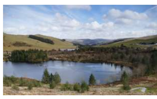
Bwlch Nant yr Arian

We'd had a couple of very relaxing hours at Bwlch Nant yr Arian, but there were still some more gems to discover in these hills and valleys. Retracing our earlier journey, we dropped down the hill towards Aberystwyth and, after only a few minutes, we arrived in Goginan.